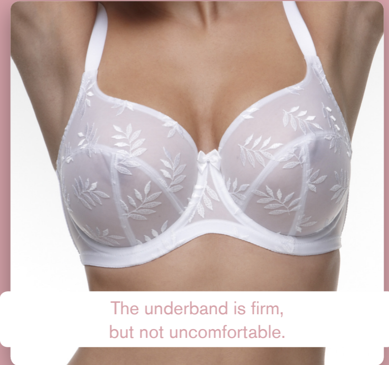
The underband is firm, but not uncomfortable.