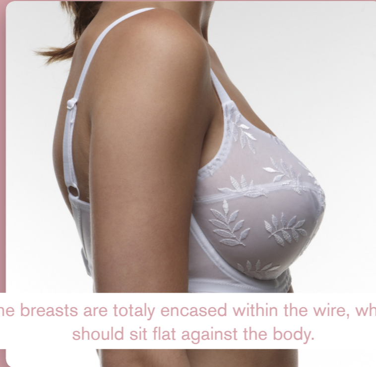
The breasts are totally encased within the wire, which should sit flat against the body.