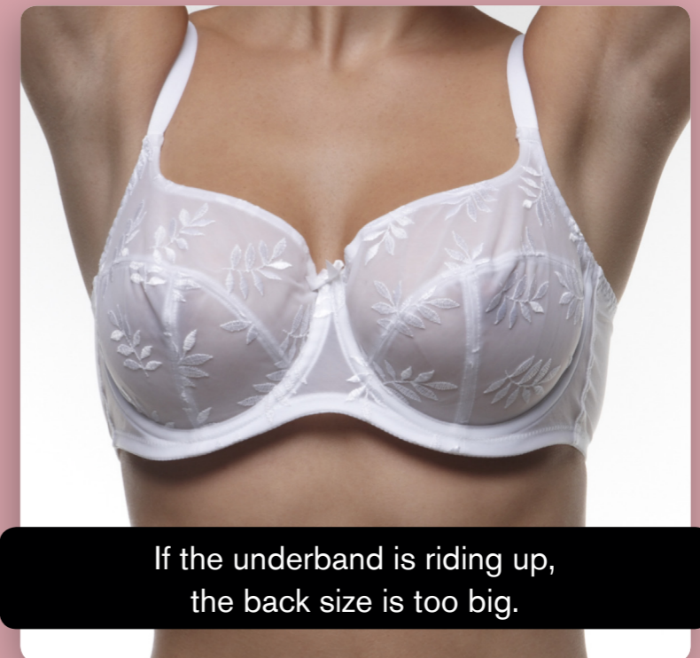
If the underband is riding up, the back size is too big.