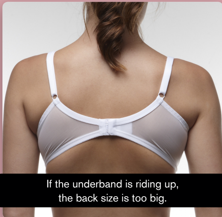
If the underband is riding up, the back size is too big.